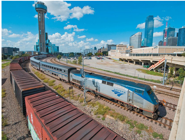
A top priority for both Amtrak and Rail Passengers is OTP.