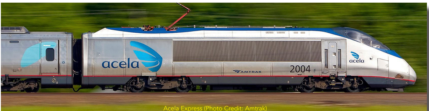
Acela Express