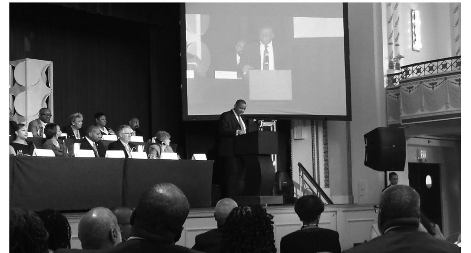
Secretary Foxx at COMTO

able to connect directly with a wide range of highly-placed transit officials from systems across the country. As we work to promote our 'A Connected America' initiative, such interactions can only be positive and constructive. Longer-range, capitalizing on our combined voices on matters of mutual interest will certainly be productive.