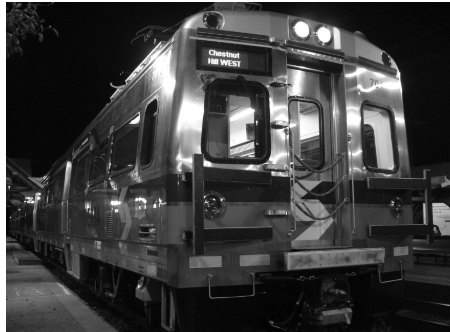
SEPTA's Silverliner V on the Chestnut Hill West Line at St. Martins station.