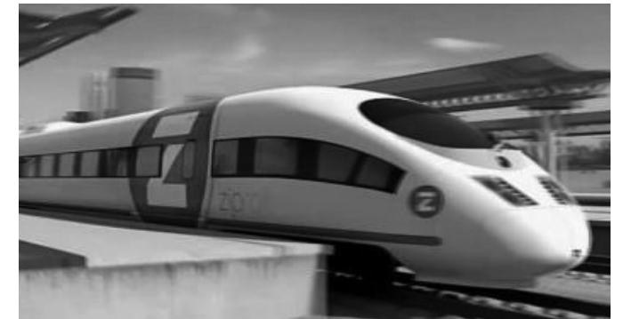
A rendering of the proposed Zip Rail

"As the backbone of a more diverse transportation system, rail service would need to be integrated with existing fixed route bus service," said the report. "It is not realistic to represent passenger